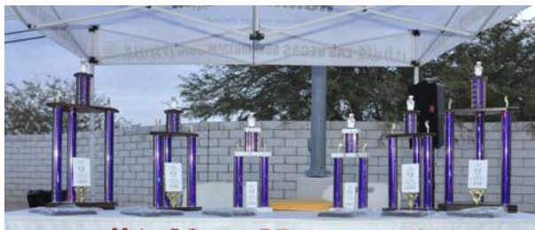
Trophies from the inaugural CFK 5K Run/1 Mile Fun Walk, Jan. 16, 2010.